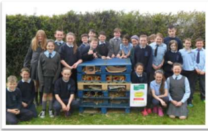
***** Our 5 star Insect Hotel