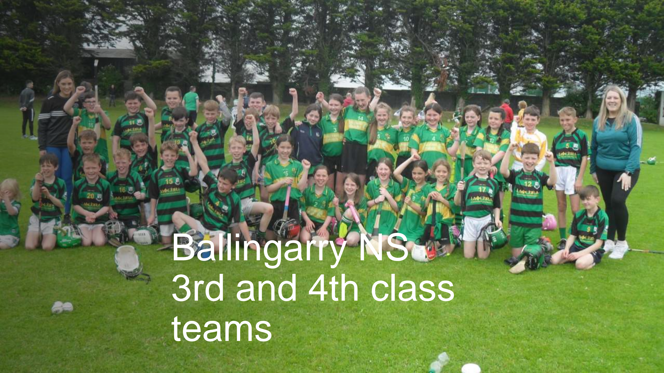
Ballingarry NS 3rd and 4th class teams