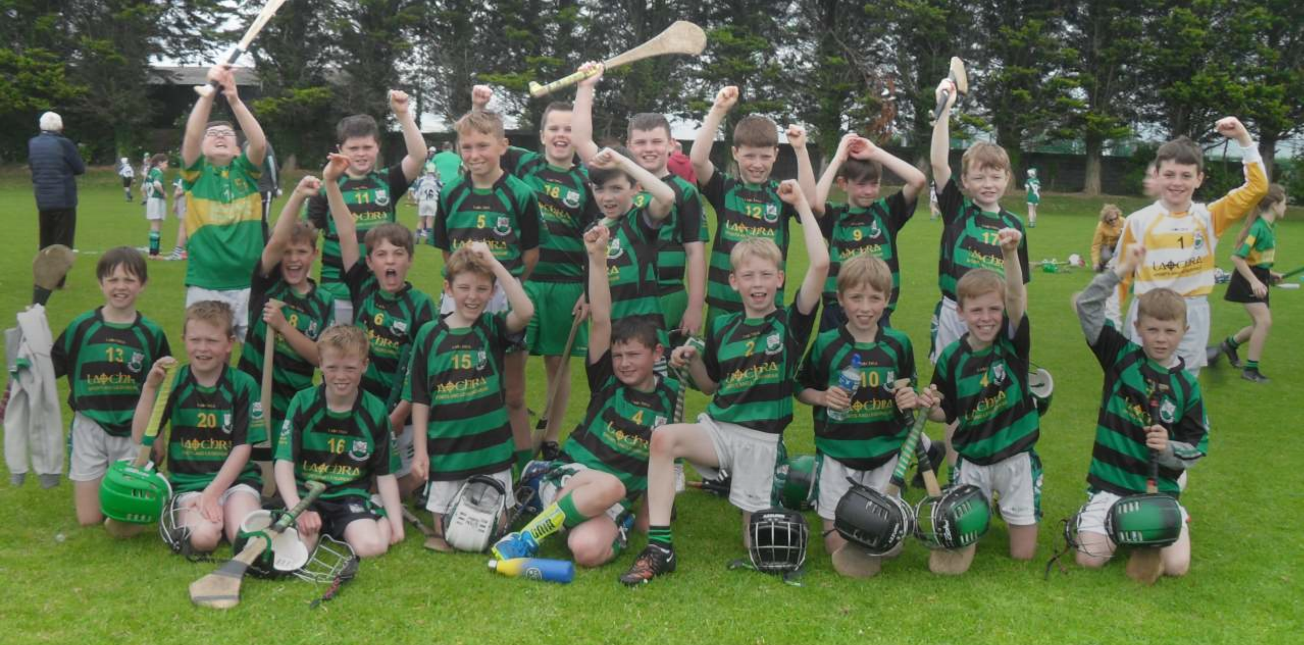
Ballingarry NS Hurling Cup Runner-up