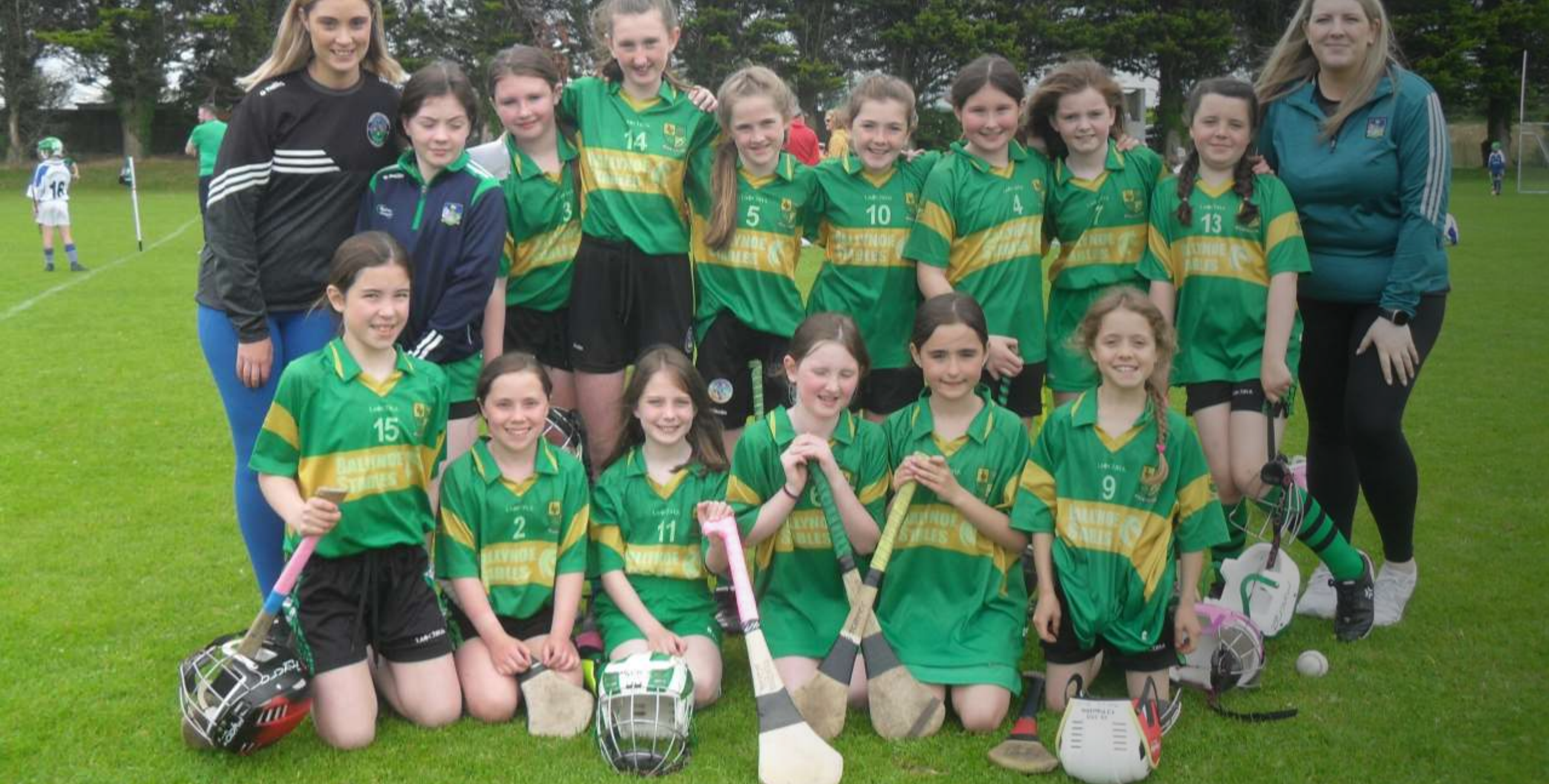
Ballingarry NS Camogie Cup champions